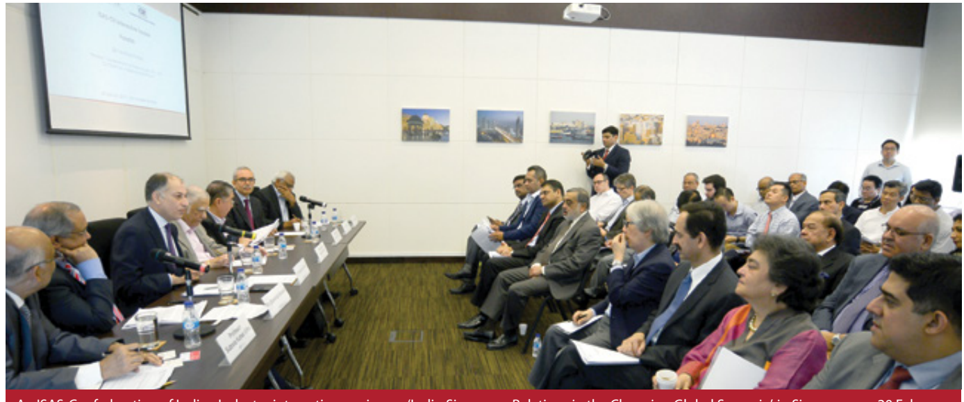
An ISAS-Confederation of Indian Industry interactive session on 'India-Singapore Relations in the Changing Global Scenario', in Singapore on 20 February 2017. Issues of economic and political importance were discussed at the event.

bodies like municipalities and panchayats . The impact of the GST in this respect will be sweeping, with the plethora of taxes that currently require to be paid by consumers of goods and services being replaced by a single consolidated tax. Moreover, the GST would also include, within itself, the different cesses levied by the Centre and states to raise revenues for specific purposes.