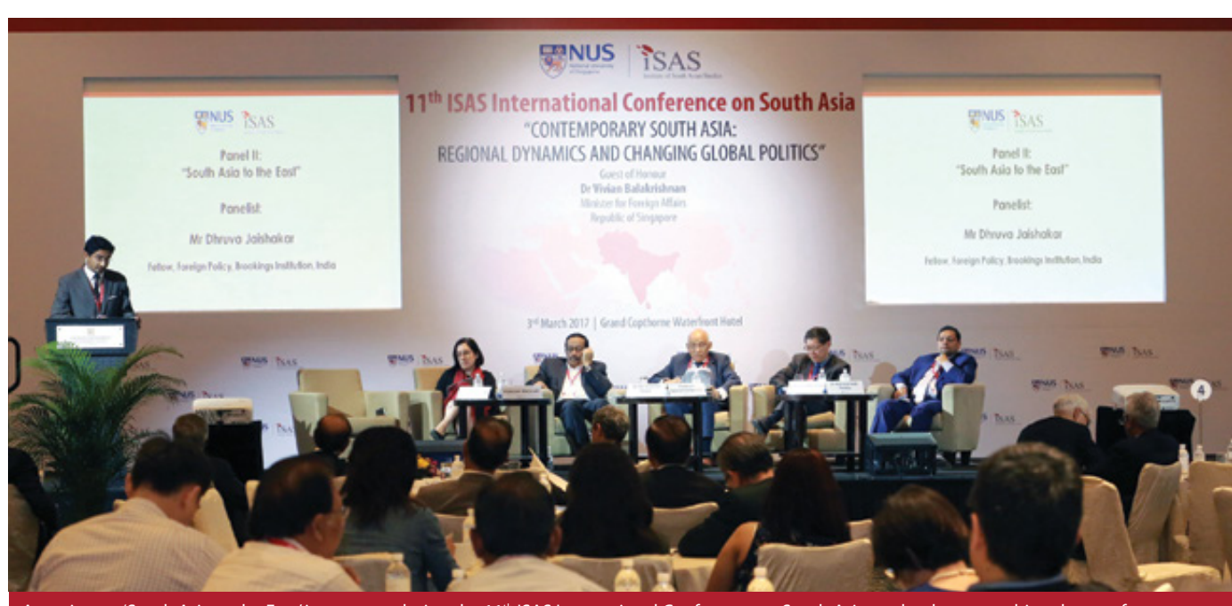
A session on 'South Asia to the East' in progress during the 11<sup>th</sup> ISAS International Conference on South Asia, under the overarching theme of 'Contemporary South Asia: Regional Dynamics and Changing Global Politics', in Singapore on 3 March 2017.

On 3 March 2017, the Institute of South Asian Studies, Singapore, held its 11<sup>th</sup> International Conference on South Asia, bringing together 21 speakers from 11 countries. Organised into four main panels, the participants deliberated on a number of themes related to the overarching topic, Contemporary South Asia: Regional Dynamics and Changing Global Politics .