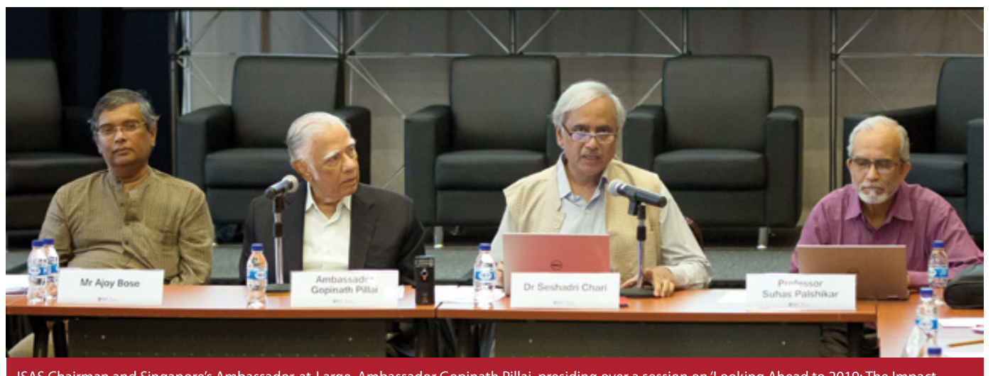
ISAS Chairman and Singapore's Ambassador-at-Large, Ambassador Gopinath Pillai, presiding over a session on 'Looking Ahead to 2019: The Impact of State Polls on National Elections' (in India) during the ISAS Workshop on 'The State of Uttar Pradesh: Indian State Elections and Its Implications,' in Singapore on 12 April 2017. Dr Seshadri Chari (second from right) is National Executive Member of India's ruling Bharatiya Janata Party.

In UP, the BJP virtually replicated its performance in the 2014 national elections, when it won 42 per cent of the vote share and 71 Lok Sabha seats from the state, and forged a broad coalition of voters. In contrast, none of the other parties managed to significantly increase its vote share from 2014. The ruling SP won 22 per cent of the vote share, the same as what it had won in 2014; the BSP received 22 per cent, marginally higher than what it had won in 2014; and the Congress, at six per cent, fell a little below the mark it achieved in 2014.