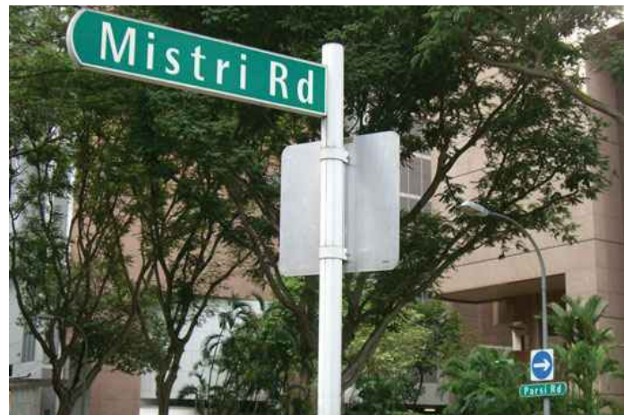
Mistri Road and Parsi Road are located within Singapore's Central Business District