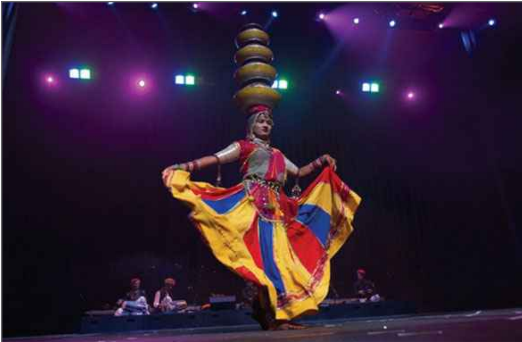
A dance performance at the 2010 Diwali celebrations in Wellington, New Zealand

The Institute of South Asian Studies (ISAS), National University of Singapore, is organising the inaugural South Asian Diaspora Convention (SADC) in Singapore from 21-23 July 2011. The SADC is expected to be a landmark event in terms of scale and variety.