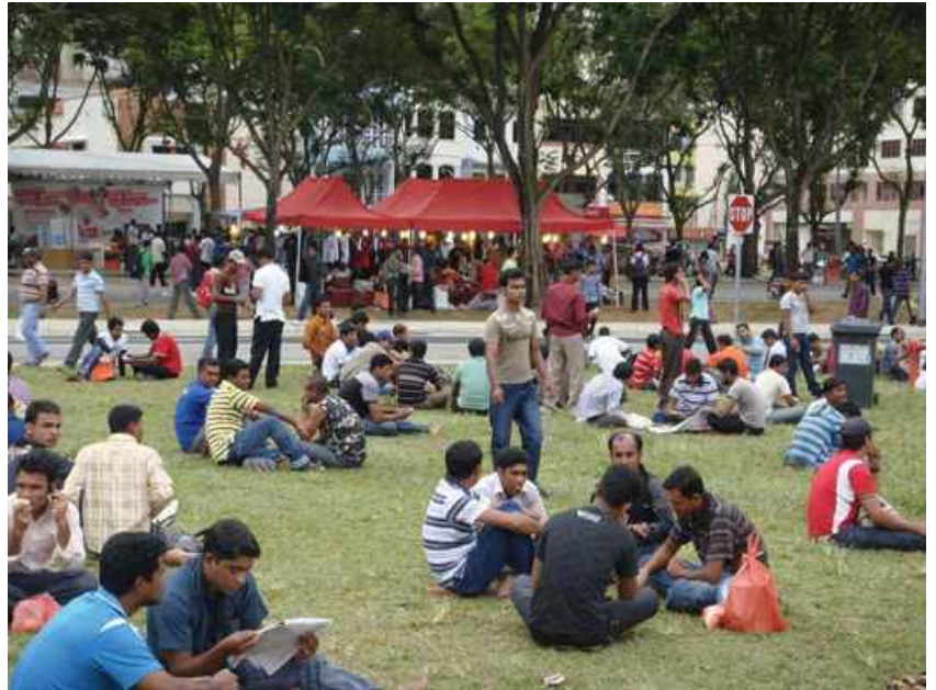
Bangladeshi migrants congregating in Little India

The strong economic motivation shapes the everyday life of migrants in Singapore. They work hard to send remittances to their left-behind families in Bangladesh. Migrant remittances are often primary source of incomes for their families and are allocated for almost everything necessary for the family's sustenance and social mobility such as food, education, house-building, medical care, and social and religious rituals. Migrant remittances contribute to 11.0 per cent of the GDP (gross domestic product) of the