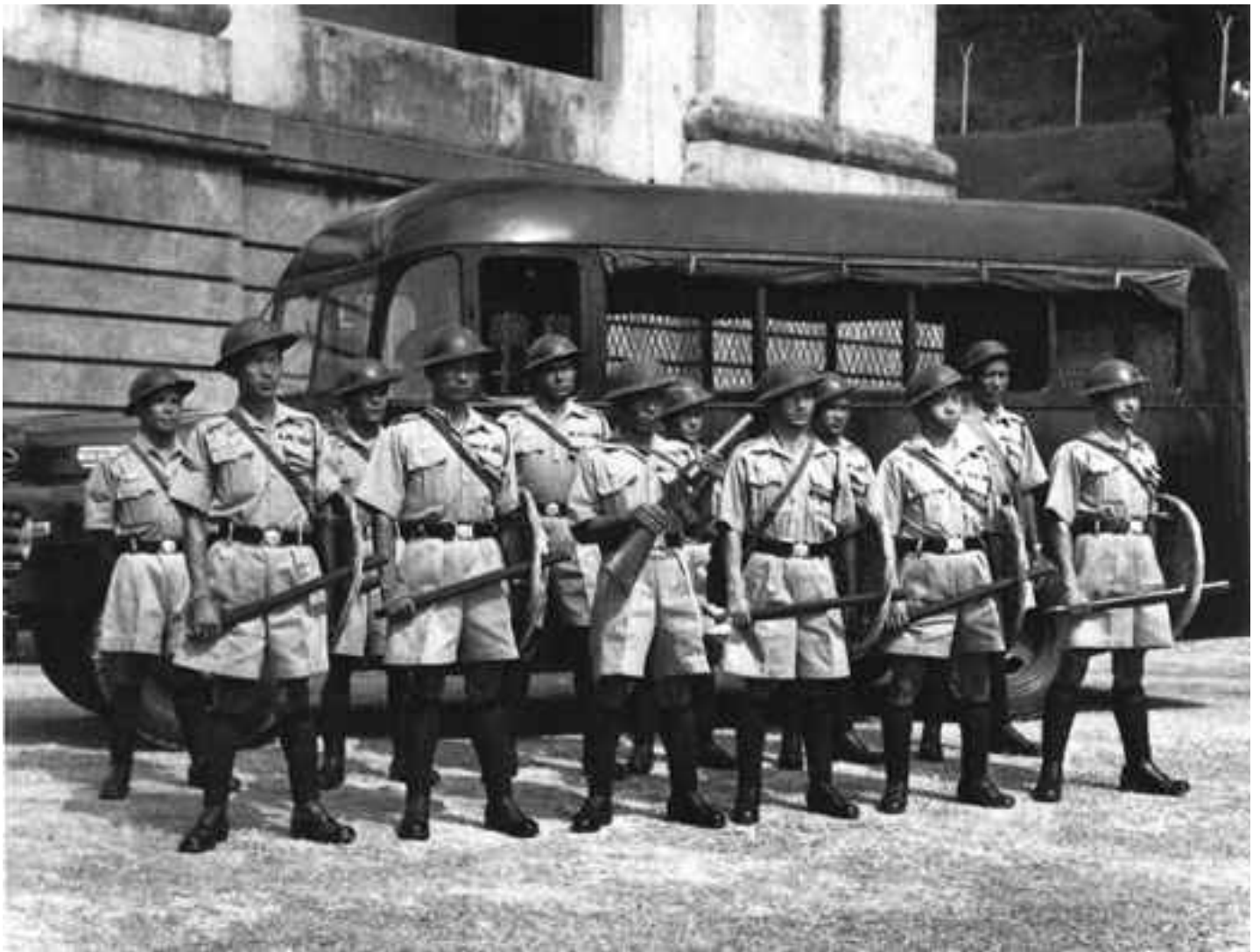
The Gurkha Company of the Singapore Police Force, taken in 1944