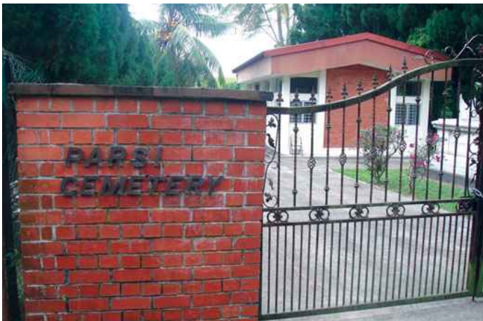
Parsi Cemetery at Choa Chu Kang