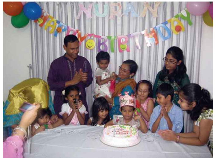
Bangladeshi immigrant family in Singapore

Bangladeshi immigrants have established language schools and formed cultural organisations to perpetuate their cultural heritage and celebrate multicultural life in Singapore. Since the 1980s, the Bengali language has been taught to Singapore students. The language received a boost in 1994 when the government of Singapore recognised Bengali as one of the five South Asian minority languages (others include Hindi, Punjabi, Urdu and Gujarati) as a second language to fulfill the requirement of the local education