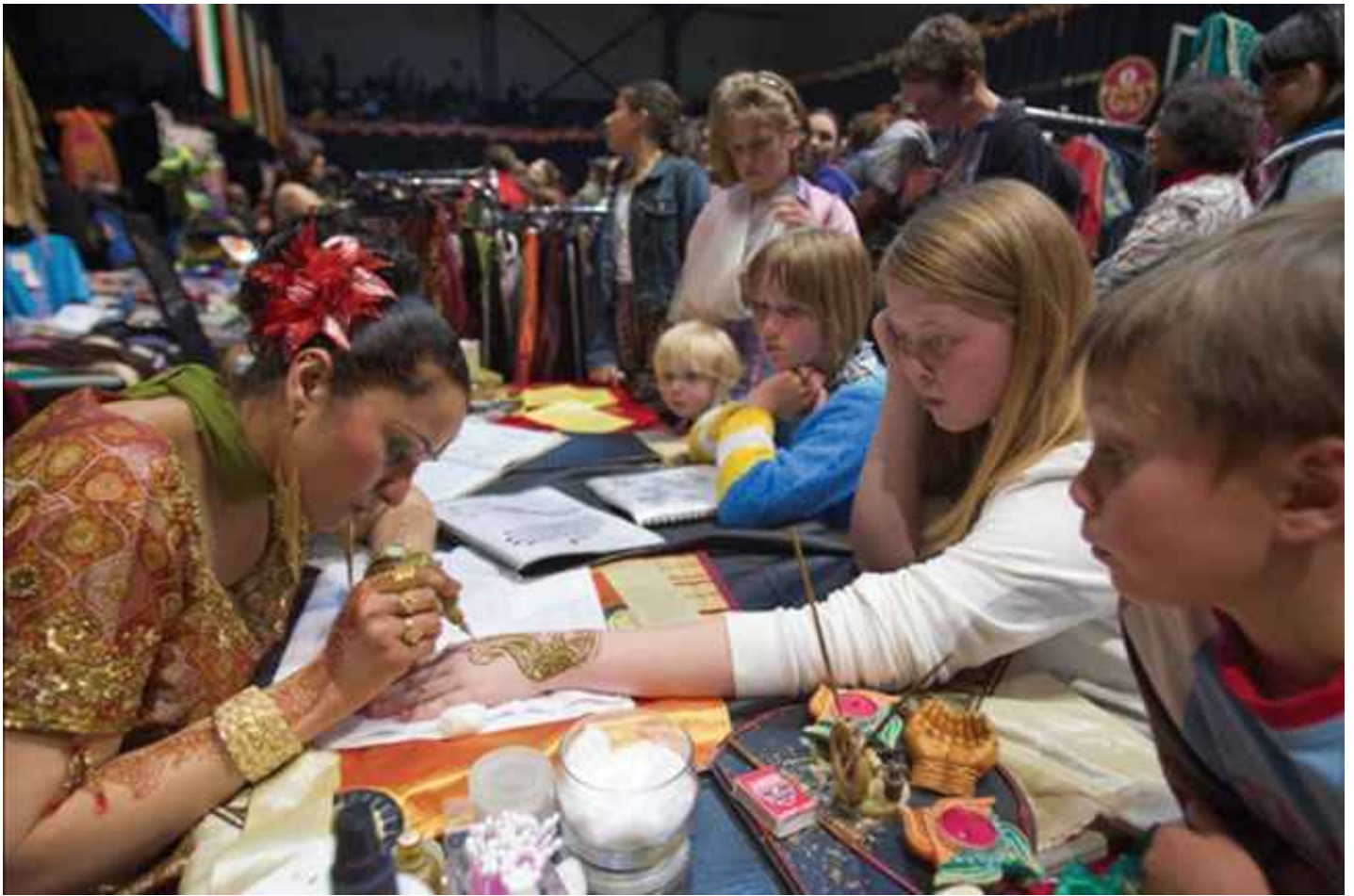
Intercultural exchange through henna art in New Zealand

of the event will have plenary sessions devoted to specific themes. The first day is devoted to the theme 'Resurgent South Asia', while the second day's theme will be 'Singapore: The Springboard for South Asia'. The speakers – prominent industrial, business, corporate, academic and media personalities from different parts of South Asia (India, Pakistan, Bangladesh and Sri Lanka), East Asia (China, Japan and Korea), and the United States – will speak in these plenary sessions on a variety of business, economic and cultural issues pertaining to South Asia. The event will also focus on Singapore's connections with South Asia, particularly the commercial aspects and business links. There will be a gala dinner in honour of H. E. Mr S R Nathan, President of Singapore, at the end of the first day. Informal networking and social interaction sessions will be part of the event. There are also plans to have cultural performances and a cricket match.