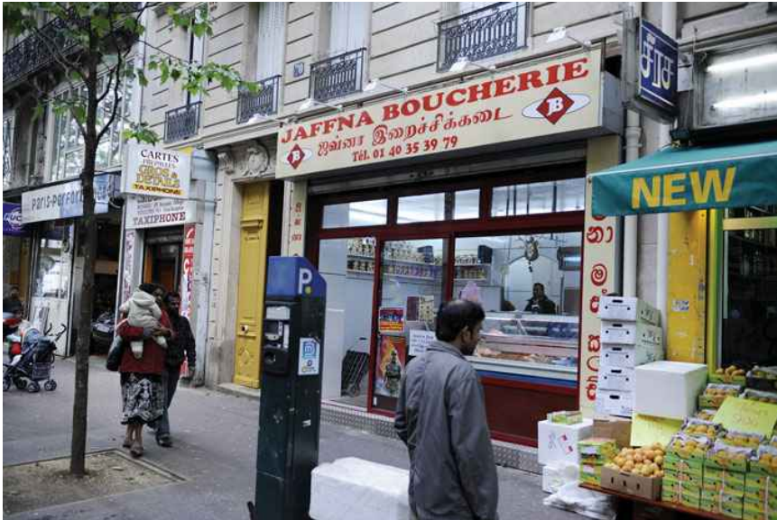
'Little Jaffna' – Tamil district in Paris

Within the Institute of South Asian Studies, there is a small working group engaged in a project which involves a worldwide group of scholars in the preparation of The Encyclopedia of the Sri Lankan Diaspora, which is scheduled for publication by a leading Singaporean publisher, Edition Didier Millet, in the second half of 2011.