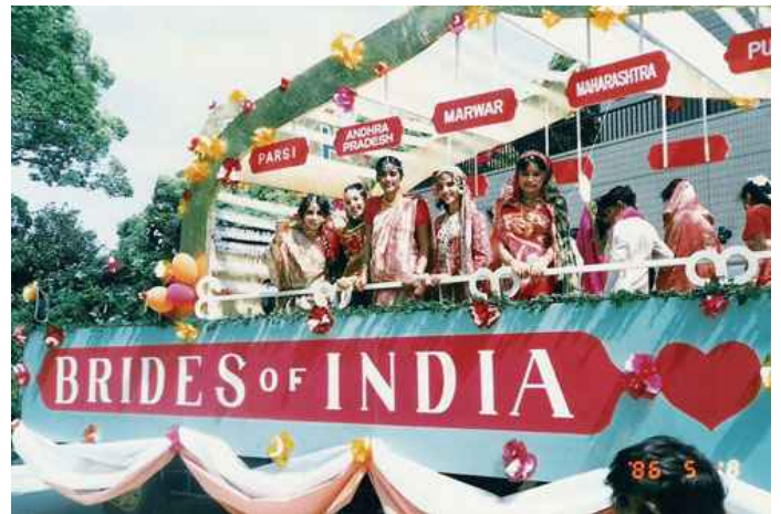
The Indian community's float at the annual Kobe Matsuri in the summer of 1986

to a baffling number of lunch groups that cement their social stature as being of affluent 'merchant class'. These groups take on the most interesting titles of: the pioneering 'Wednesday Group', who today call themselves the 'Walking Group', to promote healthy living; for the newer incoming women of the day – 'Blossoms'; and the aptly termed 'Socialites' for the 'old-timers'. Most of the women have adopted vegetarian diets and frequenting the same few outlets have prompted the restaurants to modify their menus to suit their trusty patrons. There are also the more formal organisations such as the Kansai Indian Ladies Association (KILA), which was instrumental in raising funds for victims of the Gujarat earthquake in 2001. Sadly, with the diaspora currently in decline, KILA functions in a much smaller capacity today. In a similar way, the Socialites came together to share recipes and assemble a cookbook for charity in the aftermath of the Great Hanshin-Awaji Earthquake that devastated their hometown of Kobe in 1995.