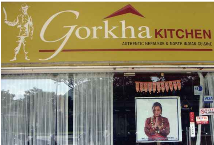
Gorkha Kitchen at Upper Aljunied Road

members of this community reside in Mount Vernon Camp on Upper Aljunied Road. Spanning 19 hectares, the Mount Vernon Camp is a self-contained area that includes various amenities to make Gurkha families feel at 'home'. Gurkha families reside in high-rise flats with a Nepalese architectural style. The Nepali-style flats are all each named after popular towns, districts, rivers and places in Nepal (eg. Pokhara Garden, Everest Heights, Babai, Makala, etc). Everest Heights is shaped in the letter 'G' while Pokhara Garden is shaped in the letter 'C'. From an aerial viewpoint they form the initials 'GC' – Gurkha Contingent. The camp also includes a majestic and traditionally architectural Nepali Hindu temple, a Gurkha Headquarters, officers' mess, family welfare centre, clinic and a minimart. The camp also hosts a large range of sporting amenities that include a large swimming pool, gymnasium, basketball court, sepak takraw court, tennis court, soccer field, track and field stadium, and playgrounds. In an effort to cater to Gurkha children, the camp has a school for Gurkha children (popularly termed as bhitra school by Gurkha families which translates to 'inside' school), and a GC Boys Club and Girls Club where Gurkha children can interact and organise games and cultural shows.