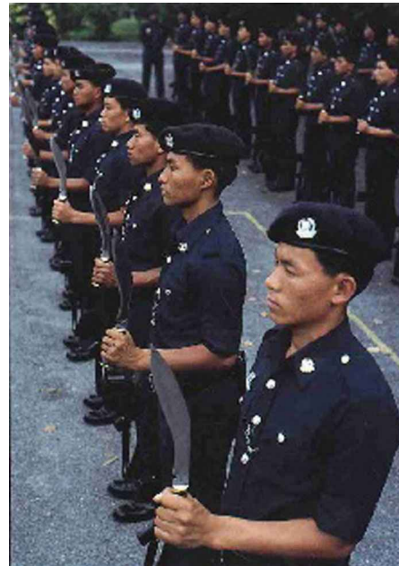
The Singapore Gurkhas; the Khukuri is a traditional knife used by the Gurkhas

During the post-independence period, the Gurkhas played a key role in Singapore's internal security and continue to be valued for their impartiality. In the 1950s and 1960s, the Gurkha Contingent was deployed during some of Singapore's most tumultuous historical episodes when racial tensions