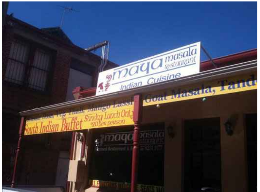
An Indian eatery along a street in Adelaide, Australia

I still feel, however, that Australia is one of the best countries in the world to