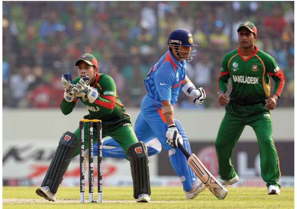
Opening match of the Cricket World Cup 2011 between Bangladesh and India held in Dhaka

The 1996 World Cup was marred by the pullout of Australia and West Indies from the matches in Sri Lanka because of security reasons. In some senses it was poetic justice when Sri Lanka beat Australia to lift the Cup in Lahore's Gadafi Stadium. Unlike 1996, the run-up to this year's tournament has been fairly smooth. And unlike multi-discipline events like with the Commonwealth