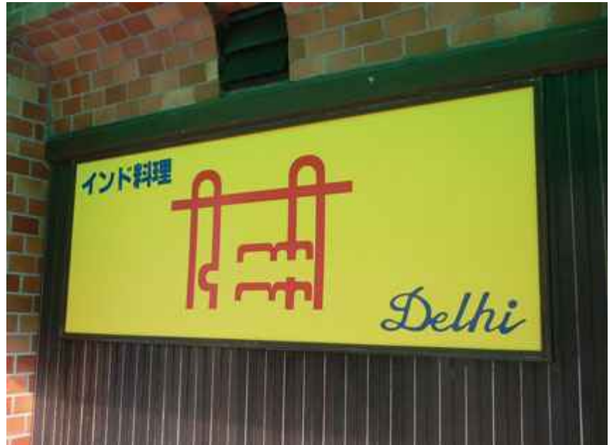
Dilli restaurant in the Kitano-cho neighbourhood of Kobe, Japan

Today, India has a much improved profile in Japan than, say, two decades ago. The professional Indian community is well regarded. Indian food has become particularly popular. In Tokyo alone, I have been told, there are close to a thousand Indian restaurants. However, language is still a great barrier – few Japanese speak English well and most are generally very shy when talking with foreigners. Japan can be a somewhat difficult place to live if one does not have the ability to converse in the Japanese language.