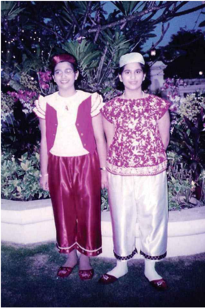
Young Parsi girls dressed in traditional attire